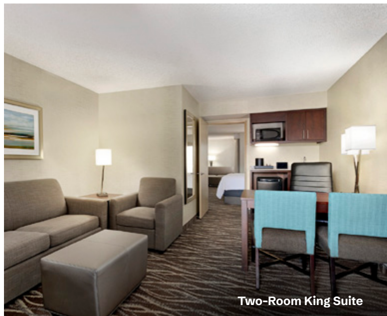
Two-Room King Suite